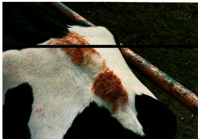
Photo 5. A few cows will lick at the tail-chalk, resulting in the bare area with the smooth lick marks apparent on the hair.

weathered and dried but no signs of riding have been apparent. Photo 4 illustrates a cow that had been chalked 10 days earlier, but had not come into heat.