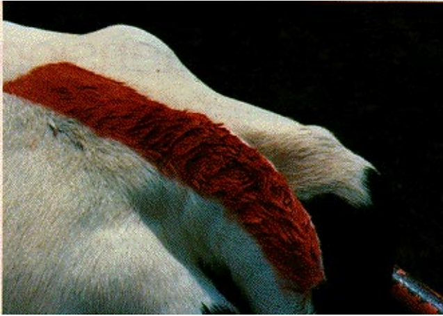
Photo 1. A freshly “chalked” cow illustrating the position of the tail-chalk from between the hook or hip bones to the vertical descent of the tail.

By far the largest percentage of cows exhibit signs of estrus at the least convenient time of the day for accurate heat detection. This fact alone is considered a major cause of heat detection inefficiency. Many of the cows that do have a “standing heat” from midnight to 6 a.m. can be observed as having “secondary” signs of heat at the time of normal heat detection on the previous evening. The secondary signs of heat include: 1) a willingness to mount other cows, even though neither cow may be willing to stand for the mount; 2) roughened tailhead or mud on the rump, which is evidence that other animals have tried to mount her; 3) restlessness, which may be indicative of a cow about to exhibit heat (cows in pre-heat may bawl more than usual, head-butt, pace the fence, sniff or lick other cattle); 4) clear stringy mucus discharge, which may be hanging from the vulva or smeared on the pin-bones or rump of a cow about to have or in estrus. Bloody mucus often appears 2 to 3 days after estrus has occurred and should be recorded in order to closely watch for heat in 17 to 21 days.