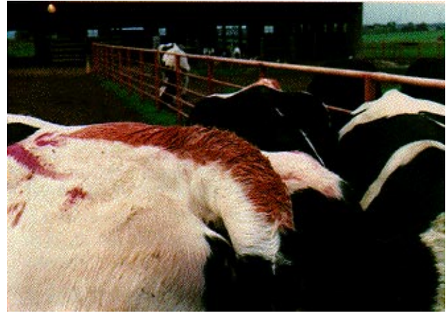
Photo 2. The same cow as in Photo 1 after riding activity has begun. Note ruffled appearance of the chalk and presence of foreign hair from the mounting animal that is caught in the chalk. The narrow, reddish mark on the extreme left has been applied by a chin-ball marker.

Several aids to heat detection are available for producers with artificial insemination programs. These aids include chin-ball markers placed on androgenized cows or deviated “gomer” bulls. This is a device similar to a ball-point pen that is strapped on the underneath side of the chin of an animal expected to mount cows or heifers in heat. The ink in the chin-ball marker leaves colorful streaks on the back or rump of a cow that has been mounted or was attempted to be mounted. Another commercially available aid to heat detection is the “Kamar heatmount detector.” This device is glued to the rump (just forward of the tailhead) of cows suspected to be in heat in the near future. Prolonged pressure (at least 3 seconds) from the brisket or chest of mounting animals will turn the originally white detector to red. Using the heatmount detector will be more effective in